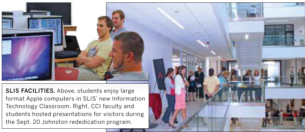
SLIS FACILITIES. Above, students enjoy large format Apple computers in SLIS' new Information Technology Classroom. Right, CCI faculty and students hosted presentations for visitors during the Sept. 20 Johnston rededication program.

For more on the William Johnston Building, go to www.cci.fsu.edu/newsletter .