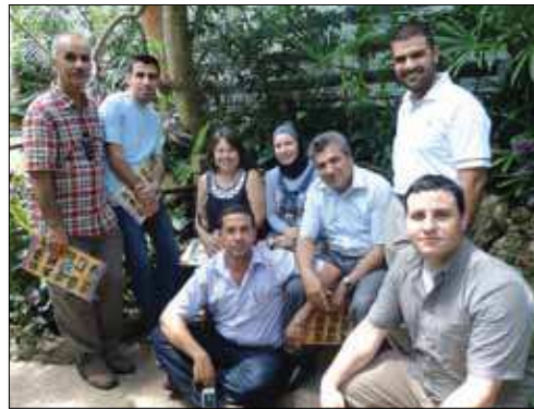
TOURISTS. Iraqi Fulbright Scholars visited the Butterfly Rainforest at the University of Florida.

Ten Fulbright Scholars from Iraq were in residence at FSU from June 29 to Sept. 3, 2011, participating in a program developed through the collaborative efforts of the Center for Global