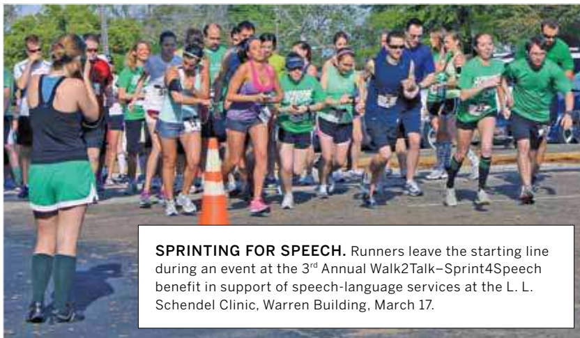
SPRINTING FOR SPEECH. Runners leave the starting line during an event at the 3 rd Annual Walk2Talk-Sprint4Speech benefit in support of speech-language services at the L. L. Schendel Clinic, Warren Building, March 17.

And for Florida State students preparing for careers in special education and early childhood education and speech-language pathology, the grant will mean enhanced opportunities for training in early intervention. Among the project's goals: work with a total of 71 students over the next five years to produce 22 speech pathologists, 27 early-childhood special educators and 22 interdisciplinary pre-service professionals.