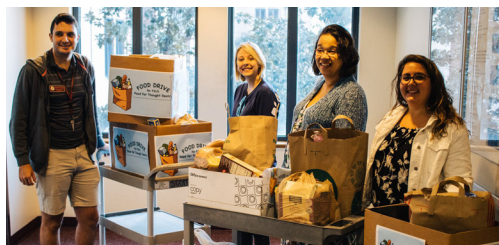
Students, faculty, and staff donated over 3 carts full of items for the FSU Food for Thought Pantry to boost the supply following Hurricane Michael.