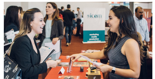
The Fall 2018 CCI Career and Internship Fair connected students with over 30 companies.