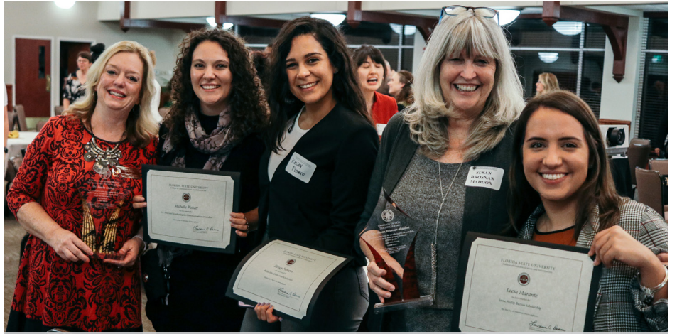
The annual CCI Scholarship and Awards Reception and Program recognizes the generosity of donors, outstanding faculty and staff, and honors students with a scholarship presentation.