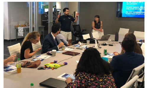
The Tally Job Hop Tech Edition helped students learn about great Tallahassee tech companies.