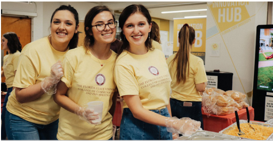
The CCI Student Leadership Council hosted the annual Fall BBQ for students, faculty, staff and alumni.