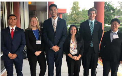
STARS Alliance students spoke with high school students in Orlando about life at FSU and CCI.