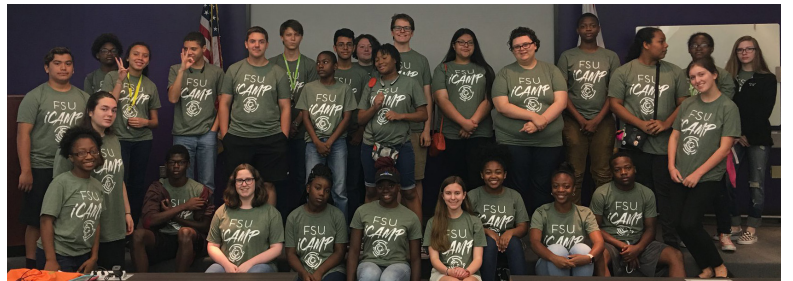
CCI received a grant from the US Army to host a six-week FSU iCamp over the summer for high school students to learn coding, web design, and more.