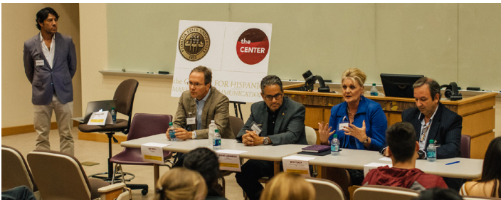
The Center for Hispanic Marketing Communication hosted a panel discussion with industry experts about multicultural marketing.