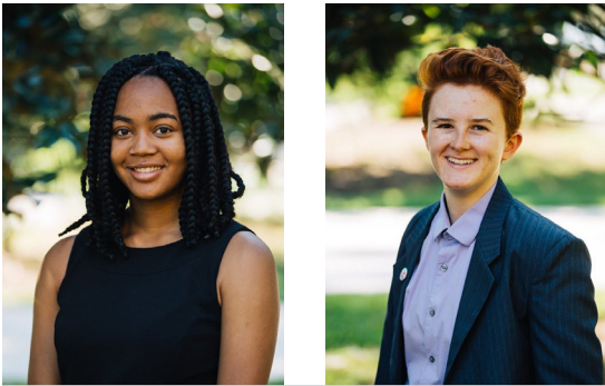
CCI offered free professional headshots for students.