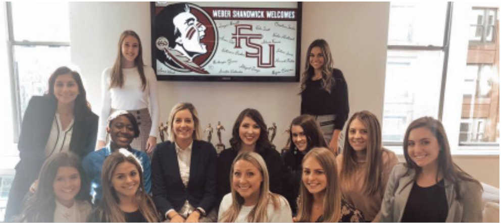
The Tallahassee Student Chapter of the Florida Public Relations Association took their annual networking trip to Boston, Massachusetts in early November.