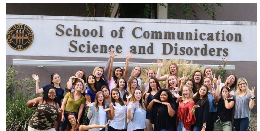
School of Communication Science and Disorders welcomed the newest class of graduate students.