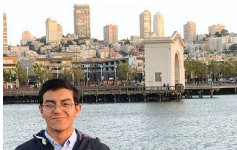
The My CCI Summer Instagram account featured students in their summer internships.