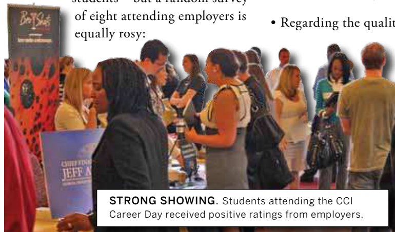
STRONG SHOWING. Students attending the CCI Career Day received positive ratings from employers.

T he numbers paint a positive picture of the CCI Spring Career Day, which took place on April 4 at the FSU Alumni Center. Not only do the largest turnout figures to date highlight a hue of success—36 employers and over 200 students—but a random survey of eight attending employers is equally rosy: