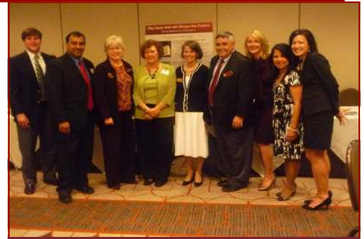
Noles in Atlanta Alumni Event