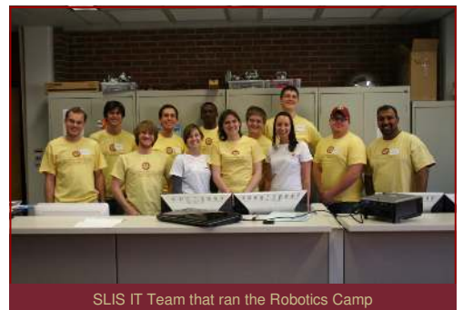
SLIS IT Team that ran the Robotics Camp