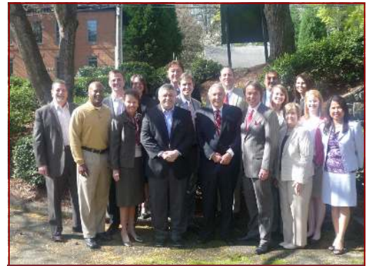
CCI Leadership Board