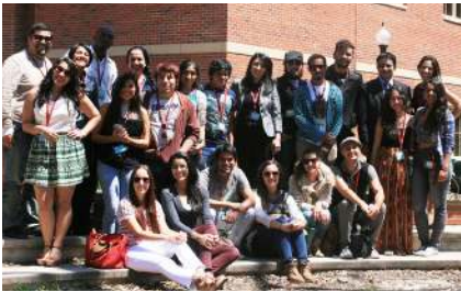
Puntos de Vista festival participants visit FSU's Askew Student Life Cinema Courtyard.

The Center for Hispanic Marketing Communication hosted the fifth edition of an International Spanish-language documentary festival called “ Puntos de Vista ”, which translates to “Points of View” in English, at the FSU Askew Student Life Cinema on April 10-11, 2014 .