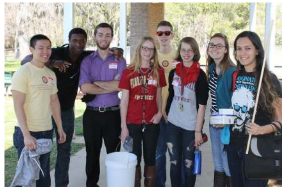
CCI and Physics students join forces to organize Physics Day.