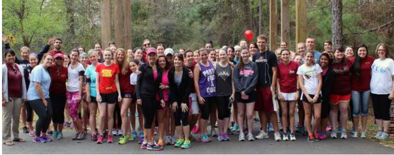
An enthusiastic group of runners participated in the 5th annual Walk2Talk 5K.

SCSD and the National Student Speech Language Hearing Association hosted the 5th annual Walk2Talk 5K at the St. Mark's Trailhead on March 22, 2014 .