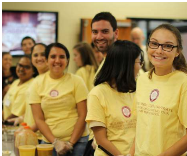
LOVE & BBQ: Kicking off Parent's Weekend, the CCI BBQ was a celebration of brisket, friends, family, and a great time!