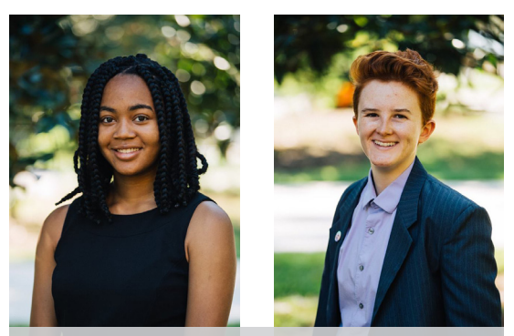
CCI offered free professional headshots for students.