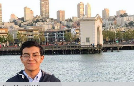
The My CCI Summer Instagram account featured students in their summer internships.