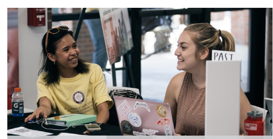
CCI Club Day was an opportunity for students to learn about the diverse student groups on campus.