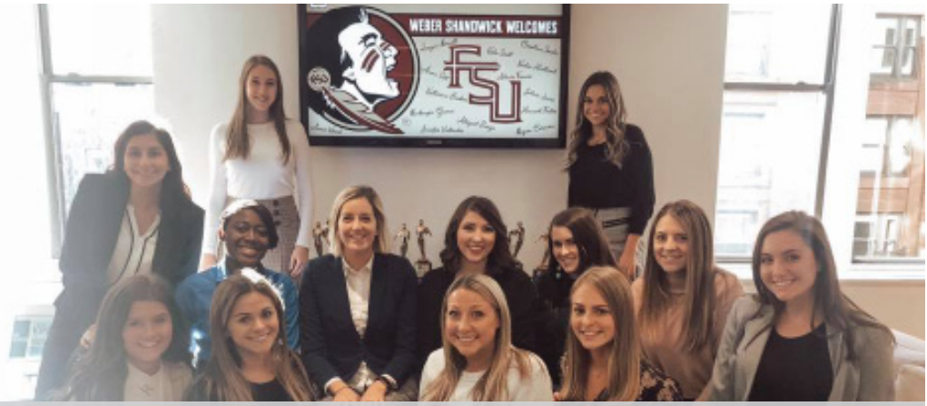
The Tallahassee Student Chapter of the Florida Public Relations Association took their annual networking trip to Boston, Massachusetts in early November.