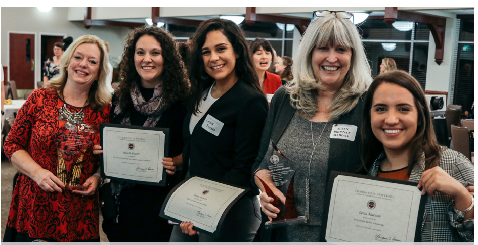
The annual CCI Scholarship and Awards Reception and Program recognizes the generosity of donors, outstanding faculty and staff, and honors students with a scholarship presentation.