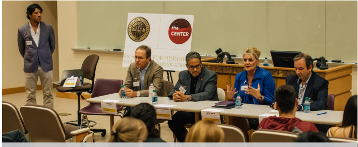
The Center for Hispanic Marketing Communication hosted a panel discussion with industry experts about multicultural marketing.