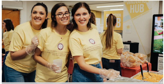
The CCI Student Leadership Council hosted the annual Fall BBQ for students, faculty, staff and alumni.