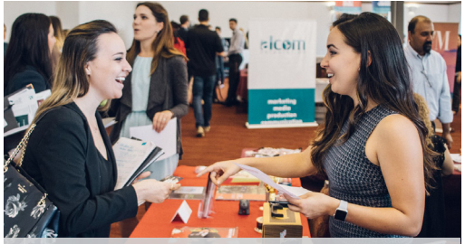
The Fall 2018 CCI Career and Internship Fair connected students with over 30 companies.