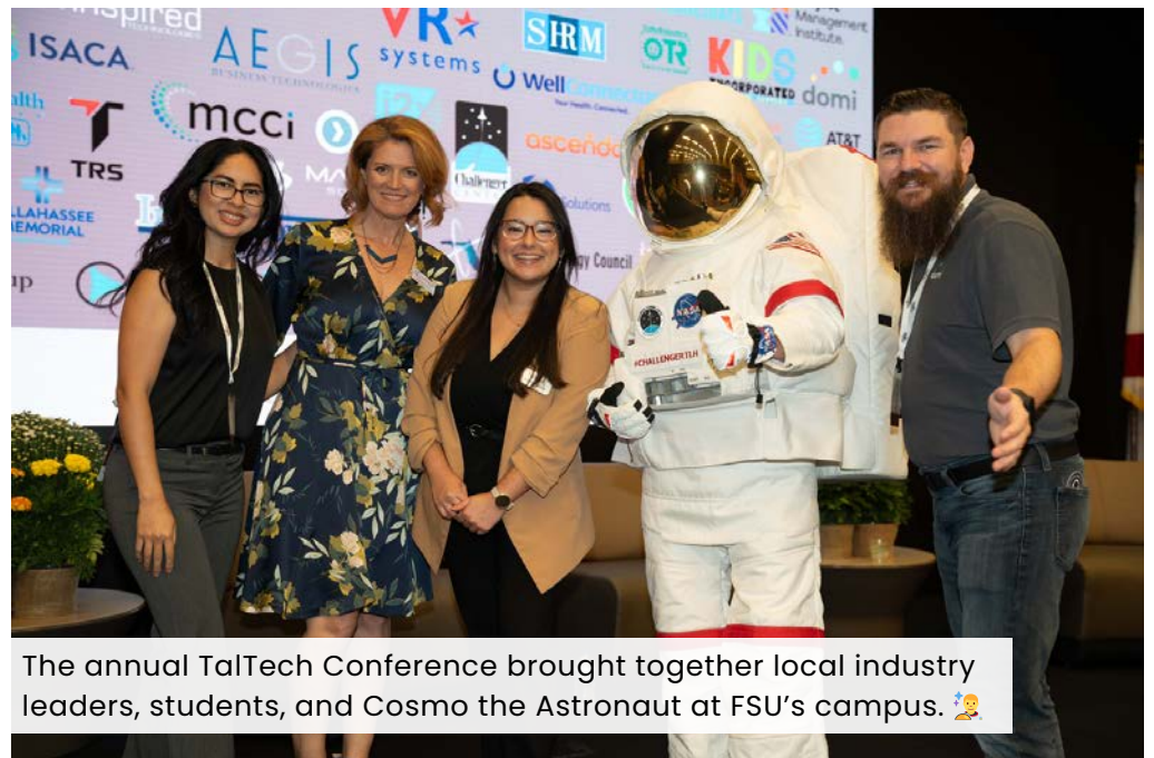
The annual TalTech Conference brought together local industry leaders, students, and Cosmo the Astronaut at FSU's campus. 🚀