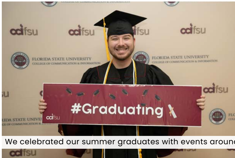
We celebrated our summer graduates with events around campus! 🎓