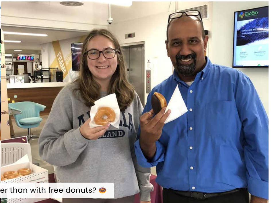
What better way to kick off the fall semester than with free donuts? 🍩