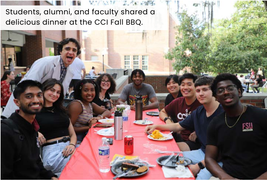
Students, alumni, and faculty shared a delicious dinner at the CCI Fall BBQ.