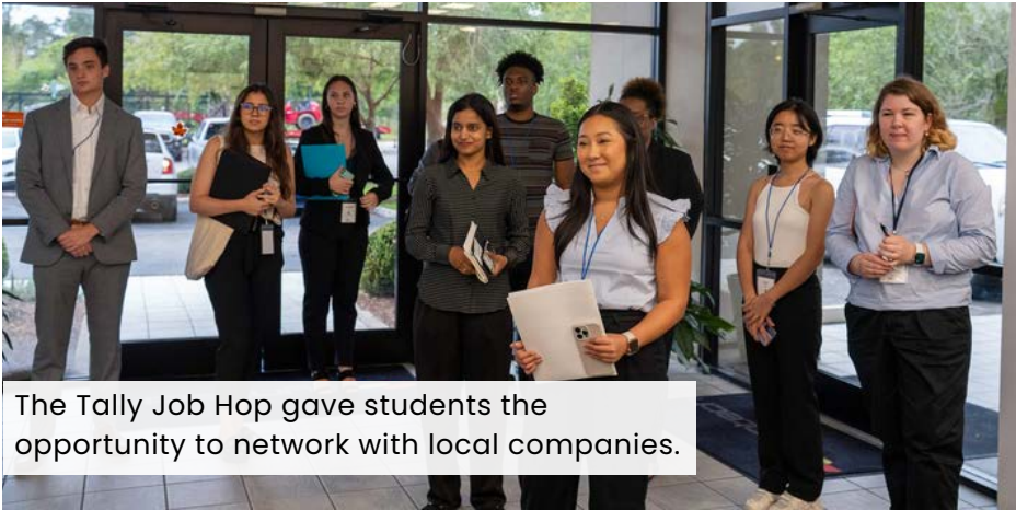
The Tally Job Hop gave students the opportunity to network with local companies.