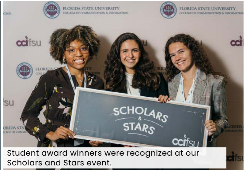
Student award winners were recognized at our Scholars and Stars event.