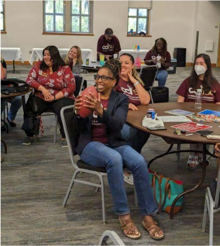
CCI staff had a ball at the annual staff retreat.