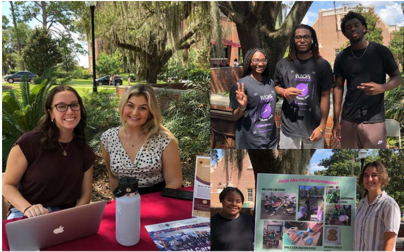
Our student orgs showed up and showed out for CCI Club Day.