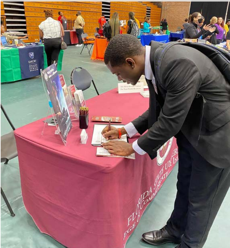
CCI met with FAMU students at the FAMU Feeder to discuss graduate program options at FSU.