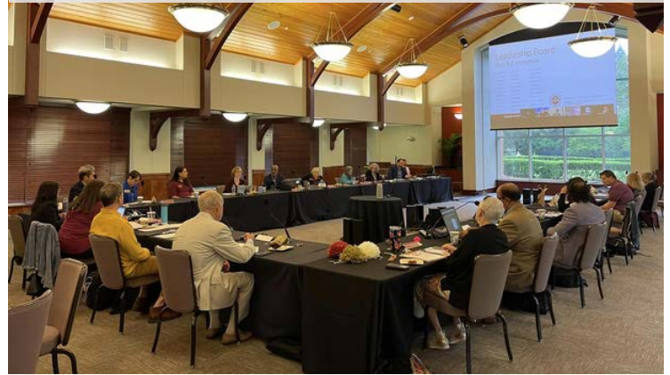
Board members and faculty met to focus their time and talent on propelling our college at the fall Leadership Board meeting.