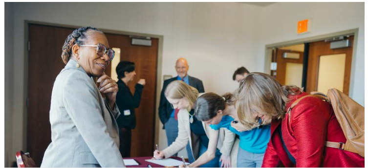
CCI helped collect donations for the FSU Food for Thought Pantry food drive.