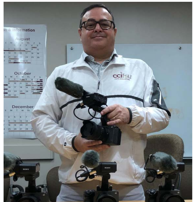
CCI's Digital Media Services unit donated 4 full camera kits to DMP's Advanced Feature Production course.