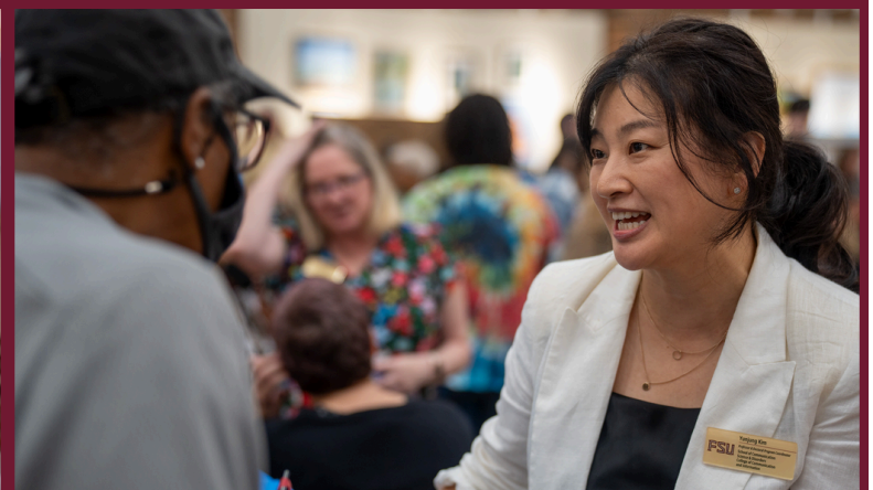
CCI faculty from all three schools attend the FSU Health Expo at the Tallahassee Senior Center.