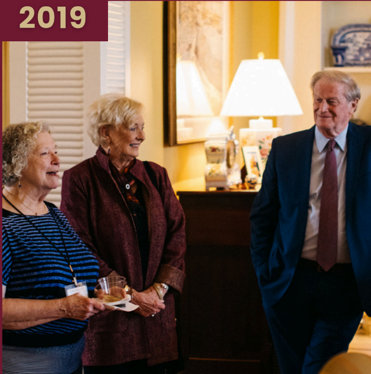
Debate celebrated its 70th anniversary.