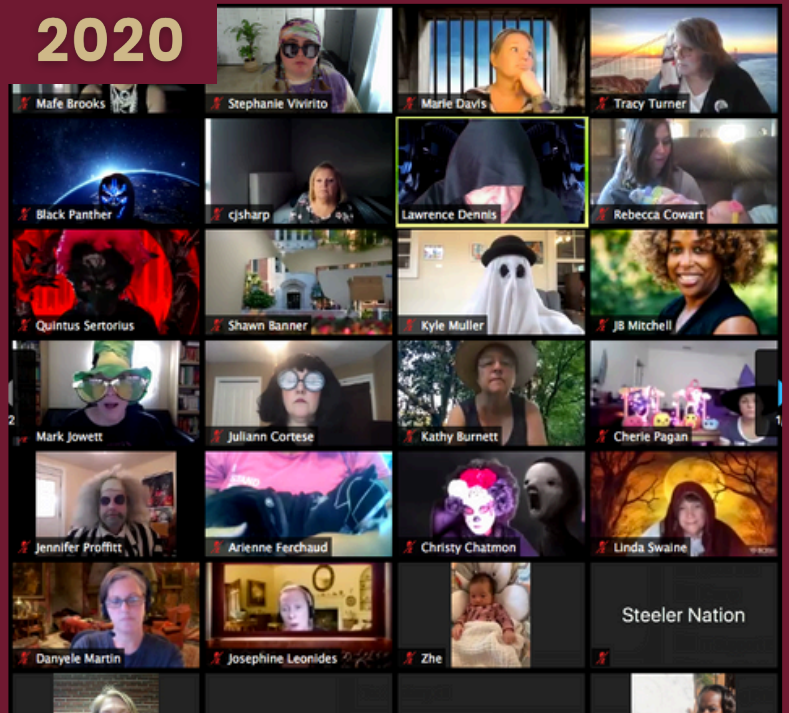
CCI found new ways to come together during the pandemic, like virtual Halloween-themed meetings.