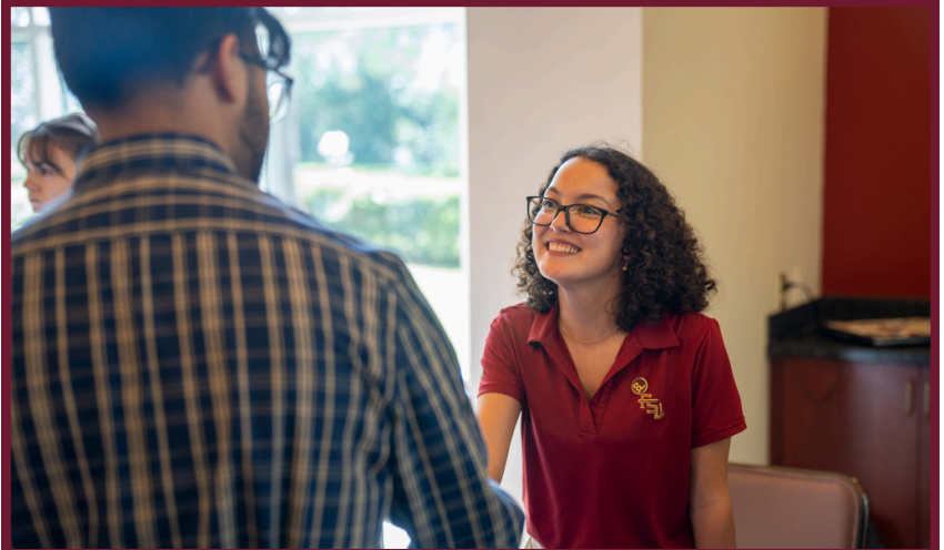
Students connect with employers at the CCI Career Fair.