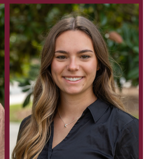
And we couldn't have a fall semester without free student headshots.