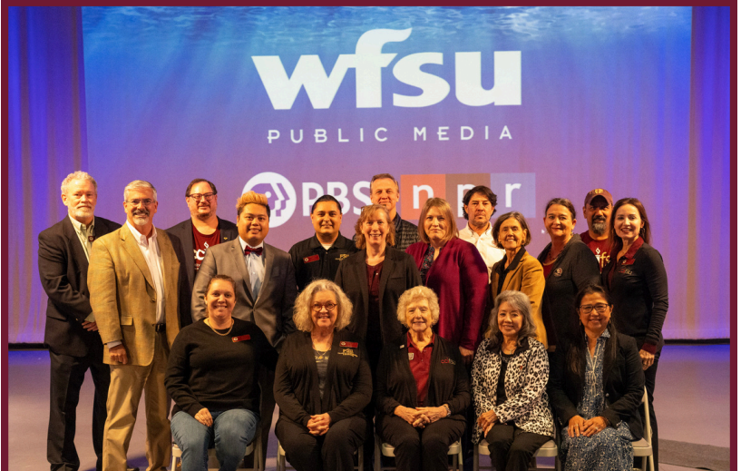
The CCI Leadership Board meet at the WFSU headquarters.