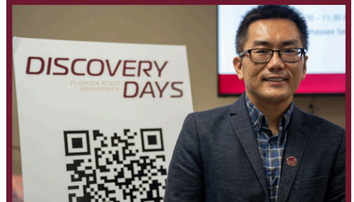
CCI faculty participate in FSU Discovery Days.