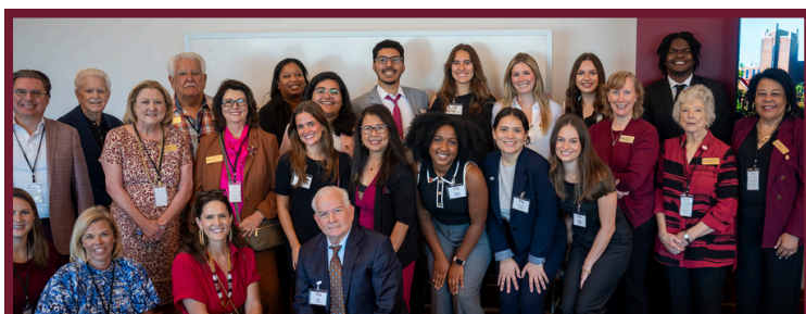
The FSU Foundation Board of Trustees toured the College, where they met current CCI students.

One of the most impactful areas of donor support has been in scholarships. Over the years, hundreds of students have received financial assistance, allowing them to focus on their studies and pursue their dreams without the burden of overwhelming debt. For many, these scholarships have been life-changing, opening doors to opportunities they might otherwise have missed.