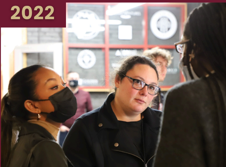
The Tally Job Hop gave students a chance to visit companies around Tallahassee.