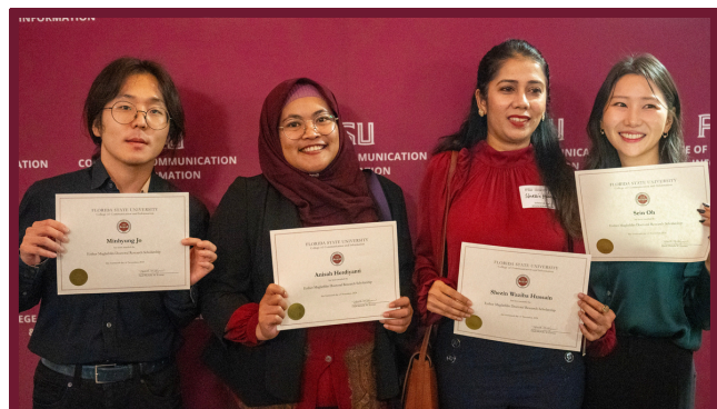
Scholarship recipients and their donors were celebrated at the Scholars and Stars event.

None of this would have been possible without the philanthropy and support of our donors. Their contributions have enabled us to provide scholarships for deserving students, fund groundbreaking research, and invest in student success. These gifts have not only enhanced the quality of education we offer but have also ensured that financial barriers do not stand in the way of student success.