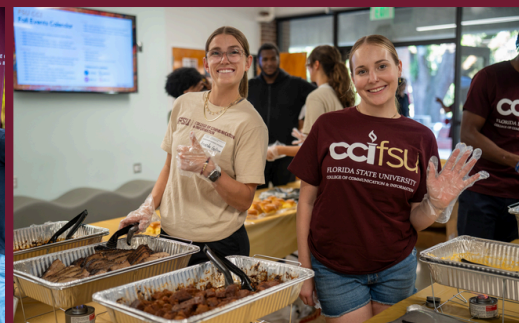
Speaking of free food...there's never a long face at the CCI BBQ!