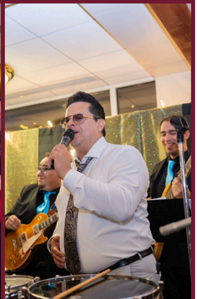
The Center for Hispanic Marketing Communication celebrates its 20th anniversary in a star-studded gala.