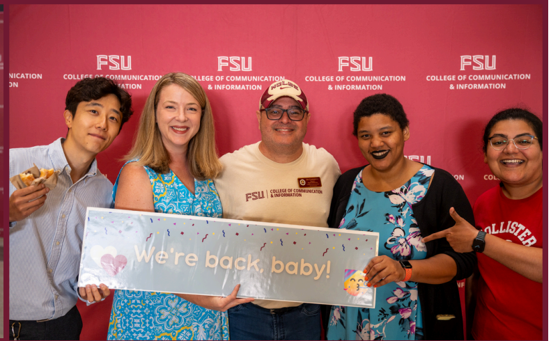
Fall 2024 kicks off with free donuts for students!