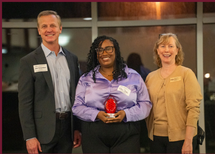
CCI recognizes over 100 scholarship recipients.