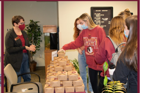
Students, faculty, and staff celebrated their long-awaited return to campus with sweet treats from the College.