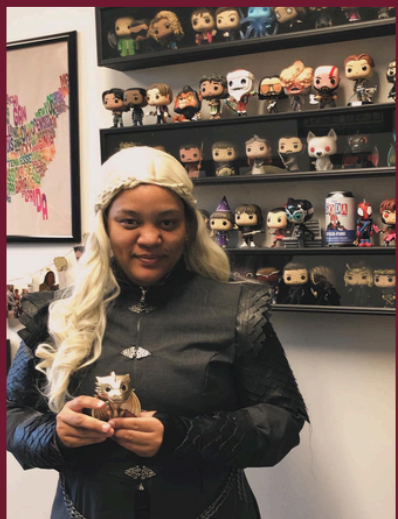
Halloween is a serious affair around the College.