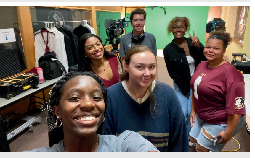
DMP students participated in the production of Homecoming Live.