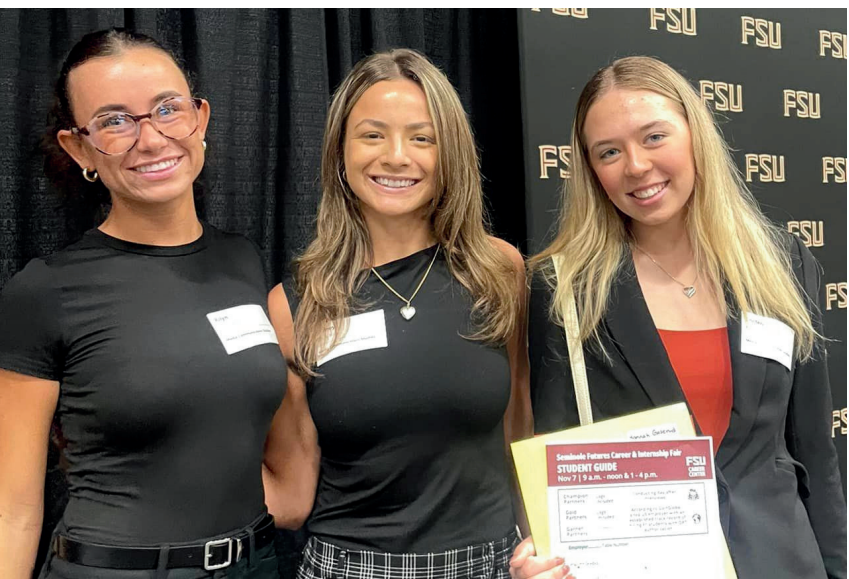
CCI students participated at the Seminole Futures Career and Internship Fair.