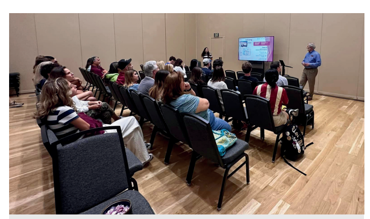
CCI welcomed new students at New Nole Orientation.