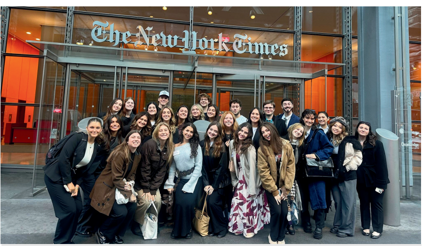
The Ad Club traveled to New York on a networking trip.