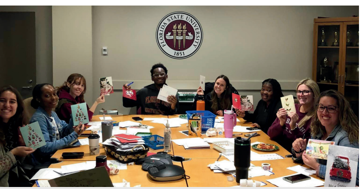
Students and staff spread holiday cheer through the Angel Card Project.