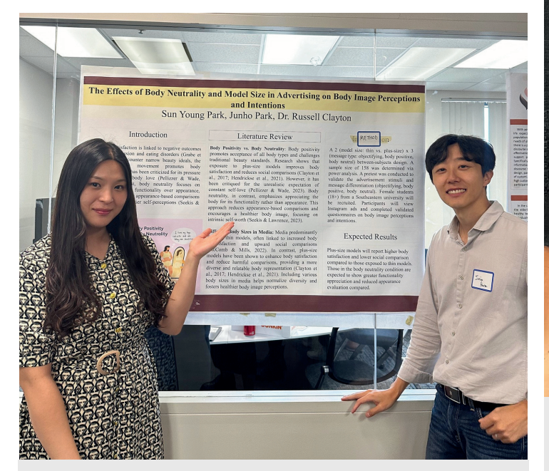
Students presented research to peers and faculty at the SCOM conference.