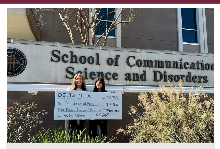
Delta Zeta gave a generous donation to the Speech and Hearing Clinic.