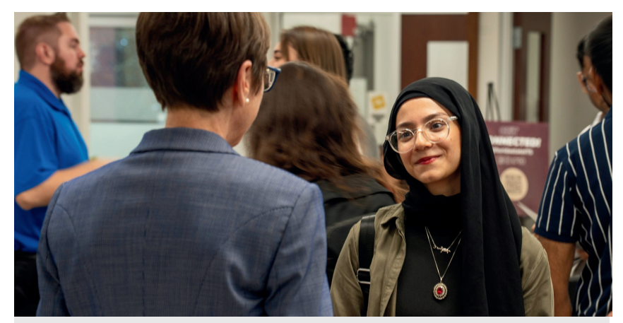
CCI hosted a Summer Meet and Greet with local employers.