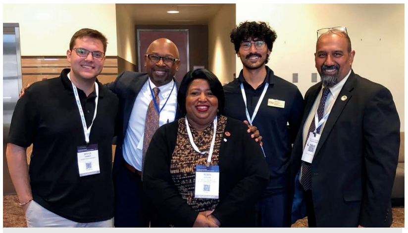
CCI sponsored the Florida Government Leadership and Innovation Summit.