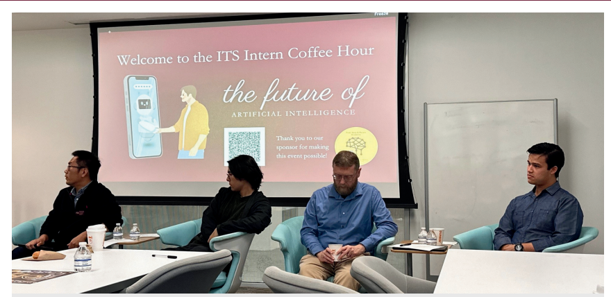
FSU IT hosted a coffee Hour to discuss the future of AI.