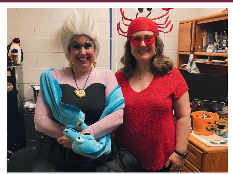
CCI faculty dressed up for Halloween.