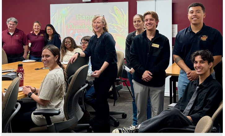
The Dean's Office celebrated Friendsgiving.