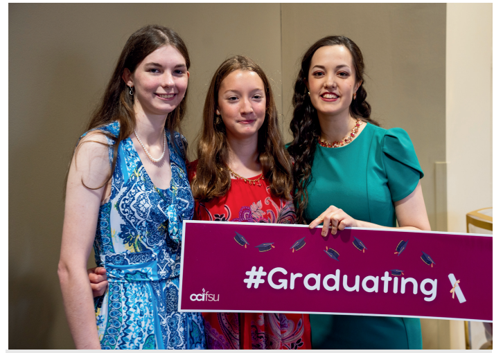
CCI celebrated our summer grads at our SCOM, SCSD, and iSchool graduation events!