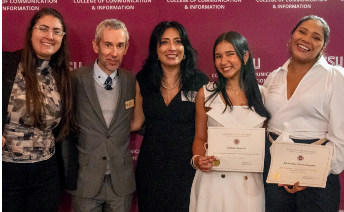
CCI celebrated students at the Scholars and Stars reception.