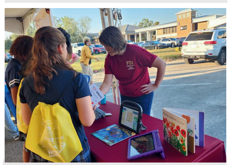
SCSD tabled at Worlds of Work to introduce career paths to local students.