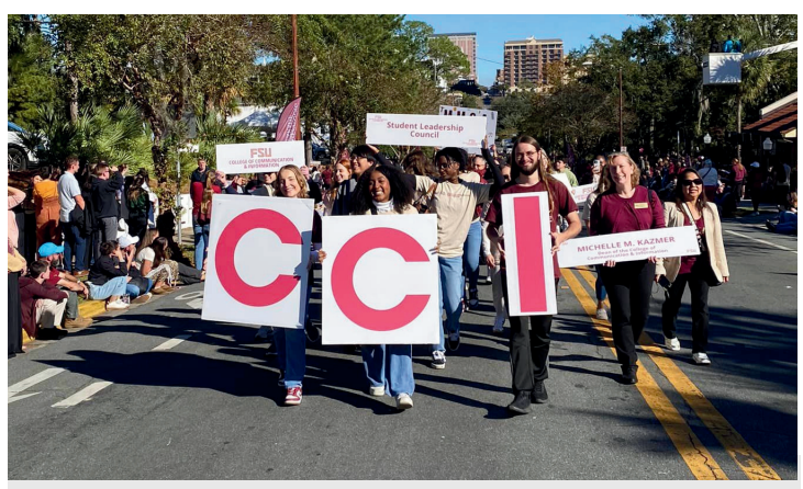
CCI walked in the Homecoming Parade.