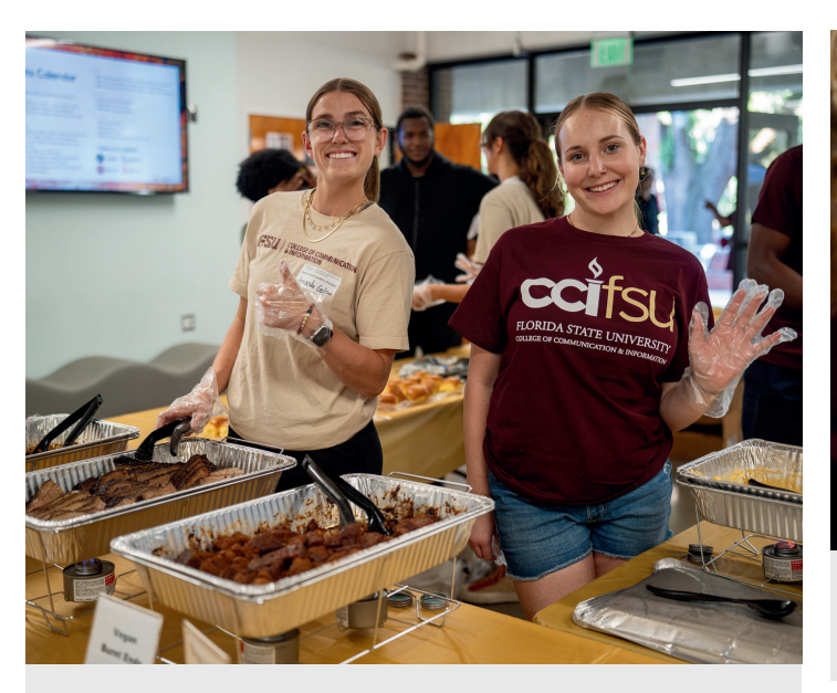
CCI hosted its Fall 2024 barbeque.