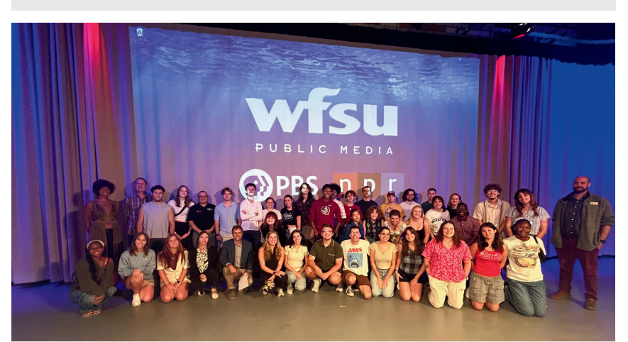
WFSU Media hosted Digital Media Production students.