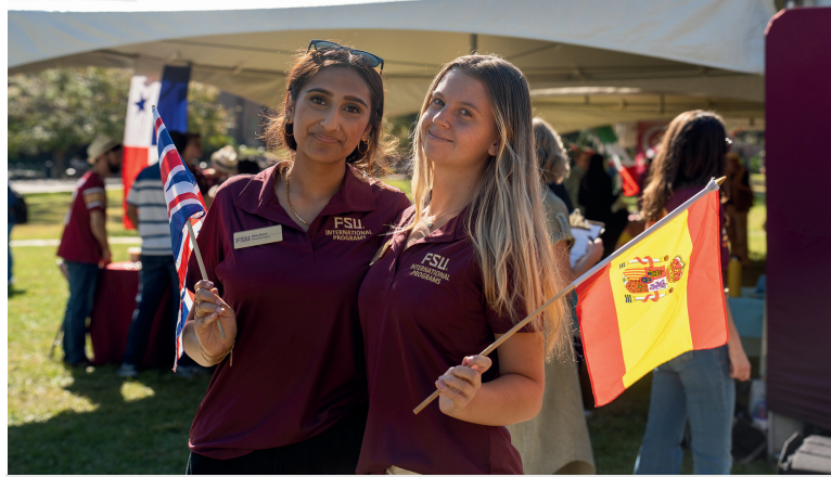
Students, faculty, and staff represented CCI at the FSU Study Abroad Fair.