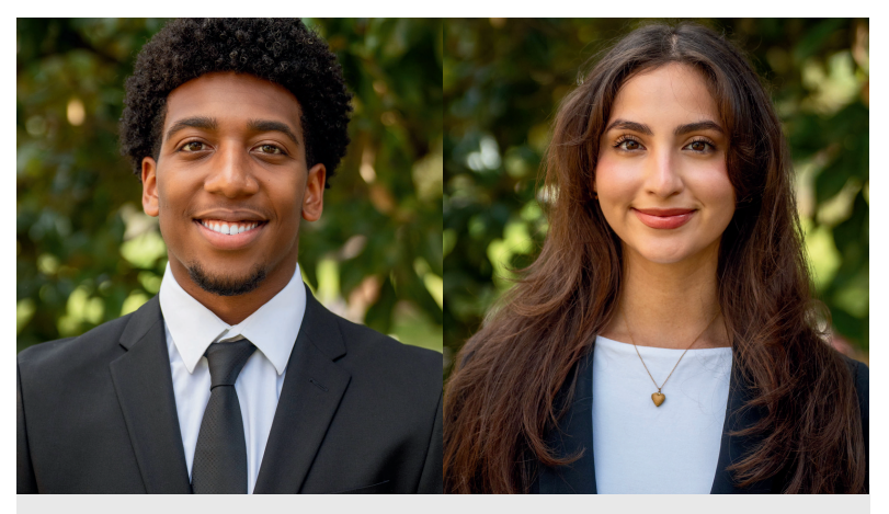
Students received free headshots at our event.