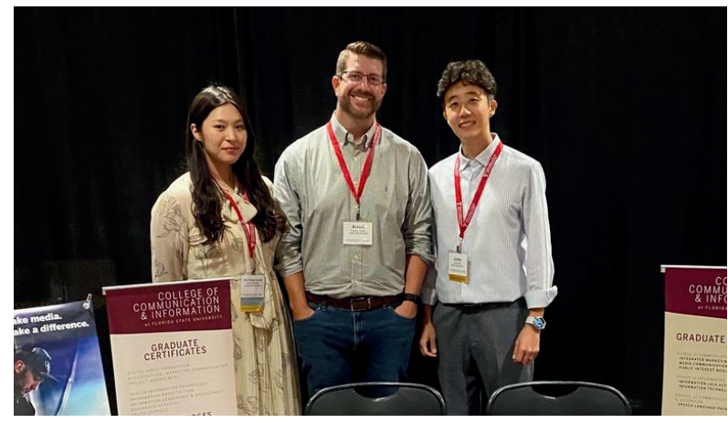
CCI students, faculty, and staff traveled to Philadelphia to present at the AEJMC conference.