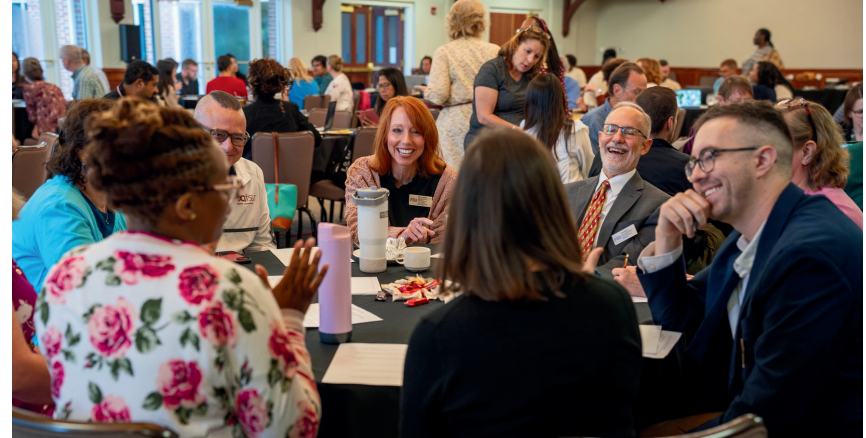
Members from all three schools met at the annual CCI retreat.