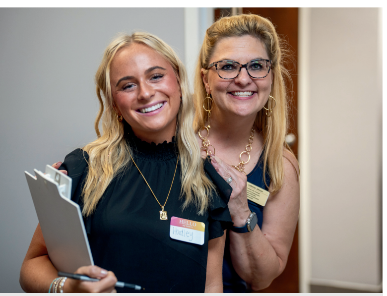
CCI students hosted free hearing screenings at the FSU Health Expo.