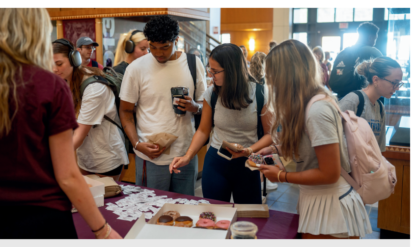
Students enjoyed welcome back donuts to celebrate the beginning of the semester.