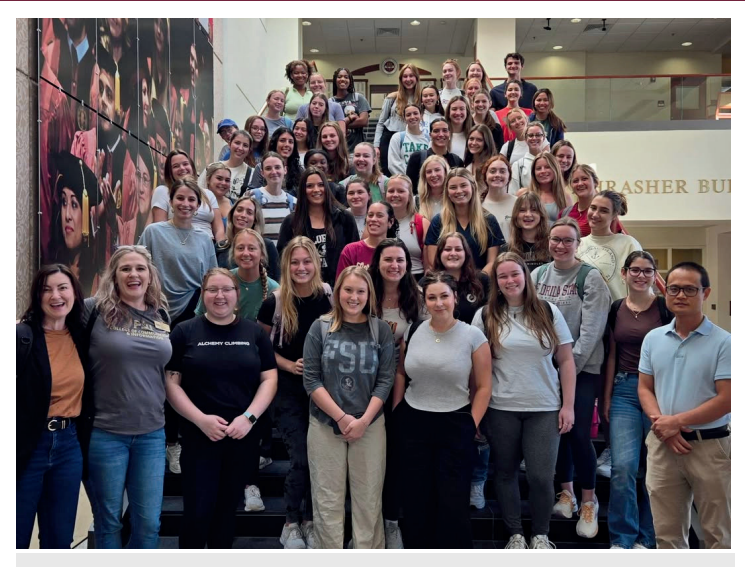
SCSD visited the College of Medicine for Brain Day.